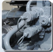
DIRECTIONAL CONTROL VALVE

Swaraj tractor, the first choice of the farmers. A powerful engine with 2000 rated r/min, makes every job easy and increases the life of the tractor. Unparalleled features and attractive design make Swaraj Tractor, an invaluable asset for its farmer.