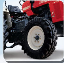
190.50 X 406.40 mm (7.50 X 16) BIG FRONT TYRE